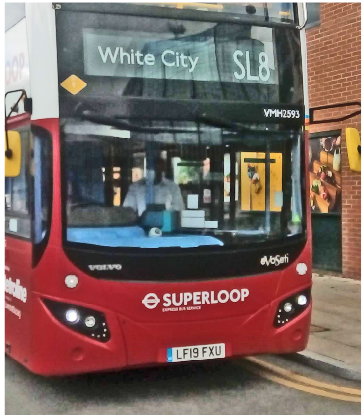
SL8 at Uxbridge

The first route to be rebranded was SL8 on 15th July.