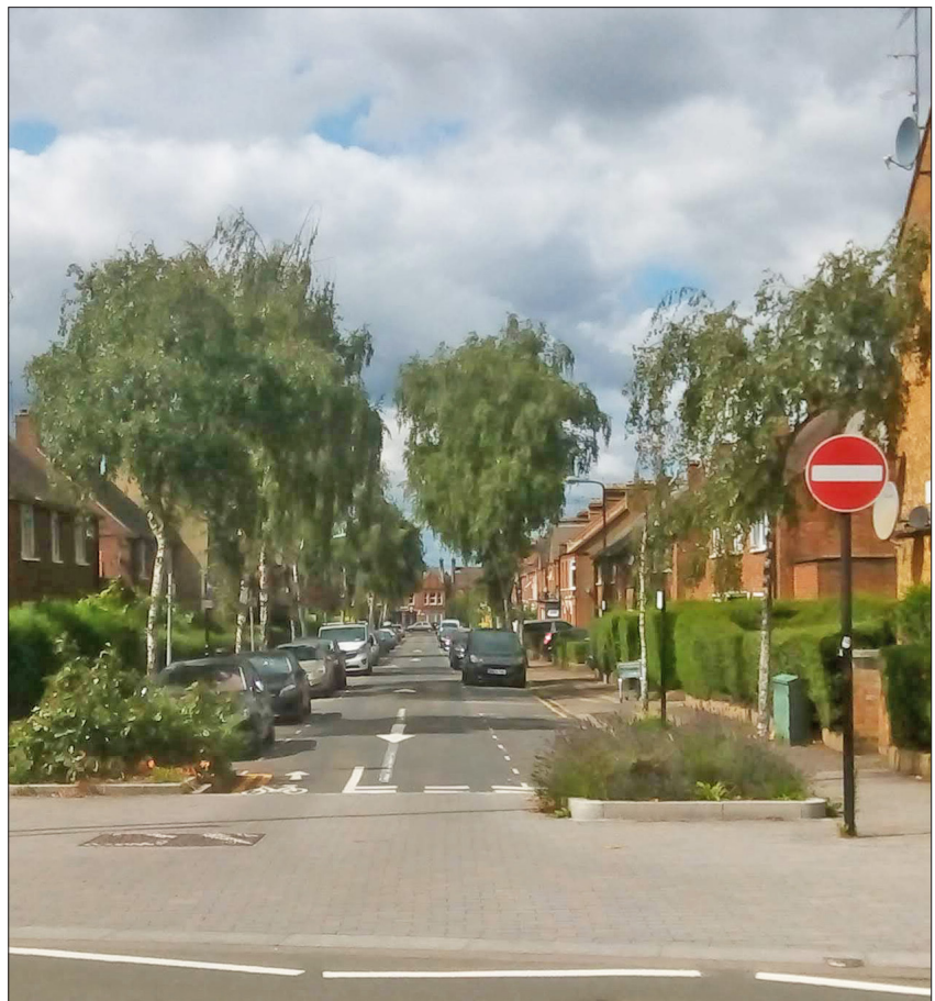
Traffic calming in Waltham Forest

Lurking at the bottom of the table are Hillingdon, Bexley and Havering with car-dominated environments failing to enable residents to switch to public transport, walking and cycling. The coalition draws attention to the fact that 38 per cent of adults and 66 per cent of children in London do not have the recommended amounts of physical activity and nearly 40 per cent of all children in London are overweight or obese. They point out that active travel (walking and cycling) instead of using cars or buses would help deal with the problem.